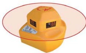
PLS PLS360E 360 Degree Horizontal Interior/Exterior Laser Level