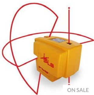
PLS PLS4 Horizontal, Vertical, and Plumb Line Laser