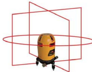
PLS HVL100 360 Degree, Horizontal, & Vertical Self-Leveling Line Laser